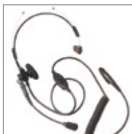
MDJMMN4066 Light weight headset with boom microphone and PTT