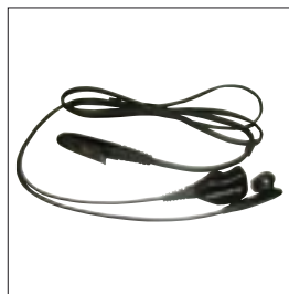
MDPMLN4519 2 wire earbud with microphone and PTT combined