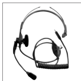
NMN6245 Light weight headset with boom microphone and PTT

The ability to perform the job while staying in contact requires good carrying solutions. The GP-R series offers a range of solutions including belt clips; nylon- and leather carry cases to offer hands free operation and optimised user performance.