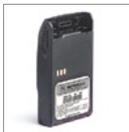
PMNN4074 IP67 Lithium Ion Battery

The power to communicate is vital and requires efficient battery and charging solutions. The GP-R series offers lithium ion batteries both as standard and FM approved together with a range of single and multi unit chargers.