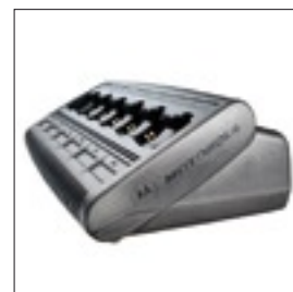
WPLN4189 Multi unit charger Impres (Euro plug)