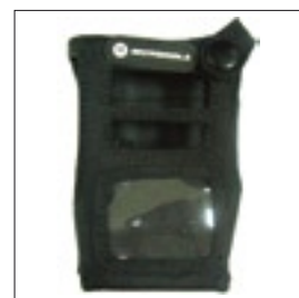
PMLN5090 Nylon carry case for IP67 radios without display