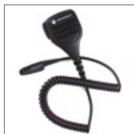
MDPMMN4023 Remote Speaker Microphone IP57 waterproof