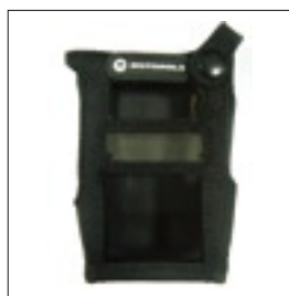
PMLN5089 Nylon carry case for IP67 radios with display