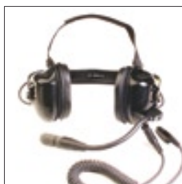
BDN6645 Heavy duty headset with ear cup PTT