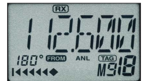
CDI mode display

The IC-A24 has VOR navigation functions. The DVOR mode shows the radial to or from a VOR station and the CDI mode shows the course deviation to/from a VOR station. You can also input your intended radial to/from the VOR station and show the course deviation on the display. In the USA version, the duplex operation allows you to call a COM channel, while you are using VOR navigation. (* IC-A24 only)